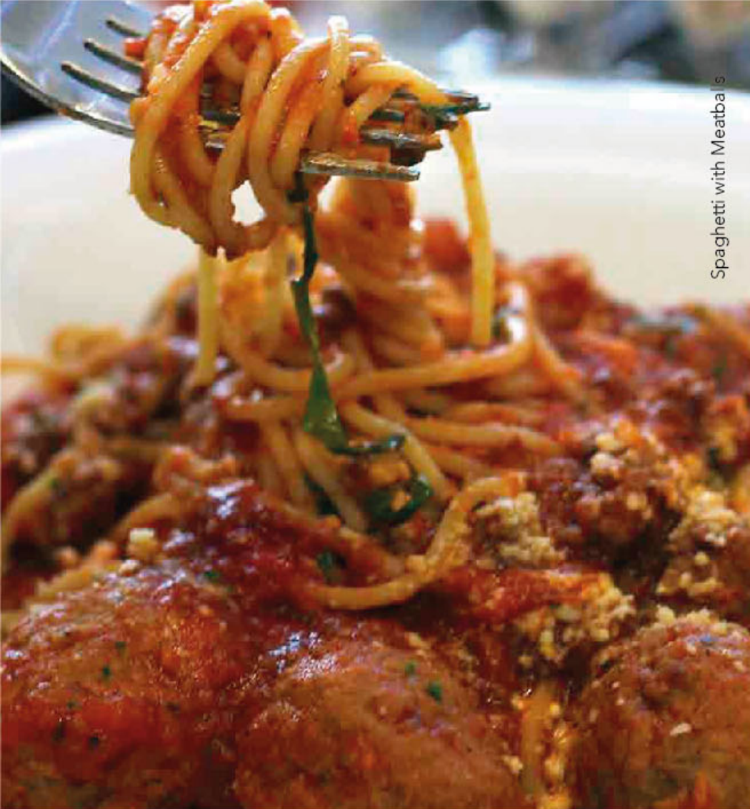
Spaghetti with Meatballs