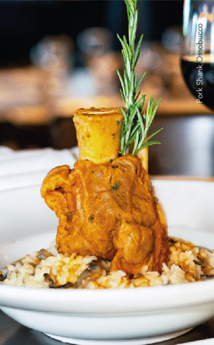
Pork Shank Ossobucco