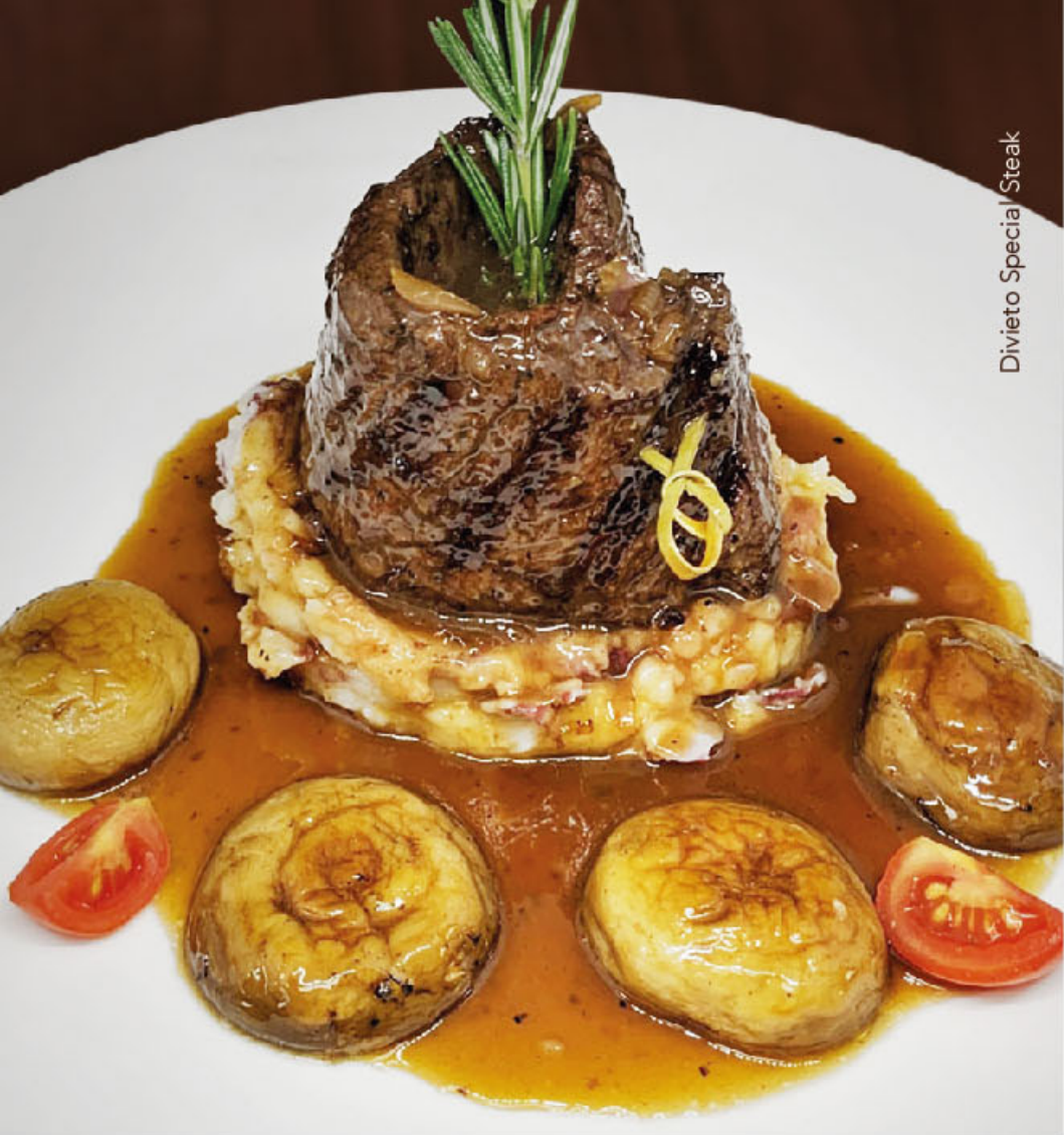
Divieto Special Steak